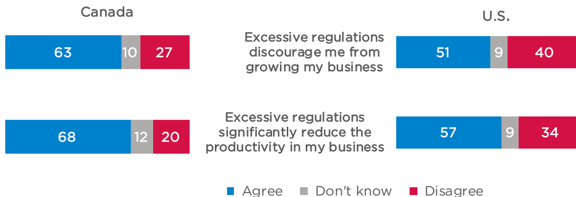
Figure 1: The Effect of Excessive Regulations on the Productivity and Growth of Small- and Medium-Sized Enterprises (% response, Canada and the US)

Sources: CFIB (2012), Survey on Regulation and Paper Burden , n=8,562; and Ipsos Reid (2012), Survey on Regulation and Paper Burden in the United States , n=1,535.